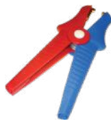
Kelvin crocodile (2 pcs) WAKROKELK06