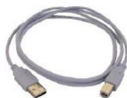
USB cable WAPRZUSB