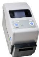
D2 portable USB report / barcode printer (Sato) WAADAD2