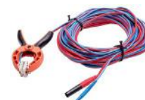
25 m double-wire test lead (Kelvin crocodile clip / banana plug) WAPRZ025DZBKEL