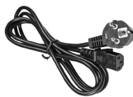
Mains cable - IEC C13 plug WAPRZ1X8BLIEC