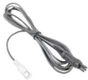
temperature probe ST-3 WASONT3