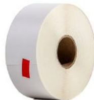
label roll – black on white for D2 printer (SATO) WANAKD2