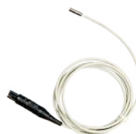
ST-1 temperature probe WASONT1