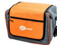
L-11 carrying case WAFUTL11