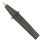
Double pin Kelvin probe (2 pcs.) WASONKEL20GB