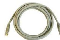
LAN cable (RJ45) WAPRZRJ45