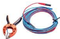
10 m double-wire test lead (Kelvin crocodile clip / banana plug) WAPRZ010DZBKEL