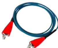
High voltage connecting cable, 2 m