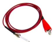
High voltage connecting cable (shielded), 3 m