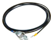
Operation ground cable, 3 m