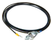
Operation ground cable, 3 m