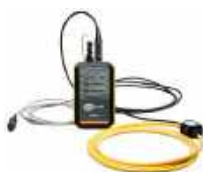
ERP-1 adapter with FS-2 flexible clamp and case WAADAERP1V2