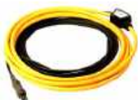
FS-2 flexible clamp (fi 1260 mm), output level 100 mV / 1 A WACEGFS20KR