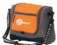
M6 carrying case WAFUTM6