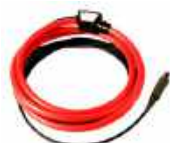
FSX-3 flexible clamp (fi 630 mm), output level 300 mV / 1 A WACEGFSX30KR