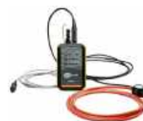
ERP-1 adapter with FSX-3 flexible clamp and case WAADAERP1V3