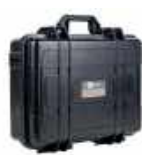
XL8 carrying case WAWALXL8