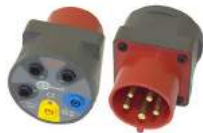
Three-phase socket adapter 16 A / 32 A