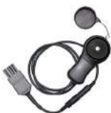
LP-10A light meter probe with WS-06 plug