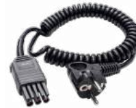
WS-04 adapter with UNI-SCHUKO angular plug