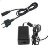
Charging Mains cable with IEC C7 plug WAPRZLAD230 Z7 power supply WAZASZ7