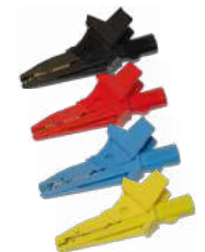
Crocodile clip 1 kV 20 A black / red / blue / yellow WAKROBL20K01 WAKRORE20K02 WAKROBU20K02 WAKROYE20K02