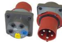
Three-phase socket adapter 63 A