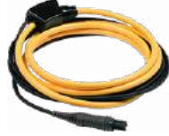
F-2A flexible clamp (Ø 235 mm)