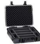
Hard carrying case for clamps