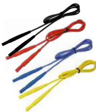
Test lead 1,2 m (banana plugs) black / red / blue / yellow WAPRZ1X2BLBB WAPRZ1X2REBB WAPRZ1X2BUBB WAPRZ1X2YEBB