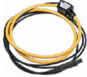
F-1A flexible clamp (Ø 360 mm)