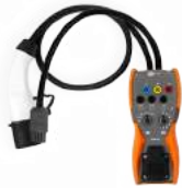
EVSE-01 adapter for testing vehicle charging stations