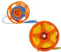
Test lead for earth resistance measurement 25 m / 50 m