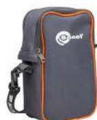
Carrying case M13 (only MPI-540-PV) WAFUTM13