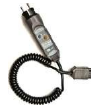
WS-03 adapter with START button with UNI-Schuko plug (CAT III 300 V) WAADAWS03