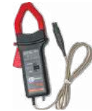
C-5A clamp (Ø 39 mm) 1000 A AC/DC