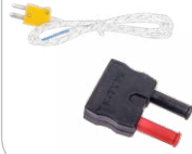
Temperature measurement Probe (K-type) WASONTEMK Adapter WAADATEMK