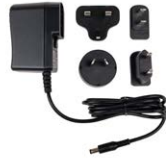
Battery charger power supply WAZASZ26