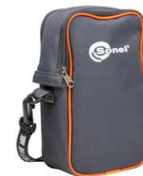
M13 carrying case WAFUTM13