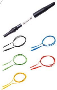
Test lead 2 m with 10 A fuse CAT IV 1000 V black / blue / green / red / yellow WAPRZ002BLBBF10 WAPRZ002BUBBF10 WAPRZ002GRBBF10 WAPRZ002REBBF10 WAPRZ002YEBBF10