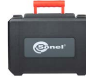
Carrying case WAWALM3