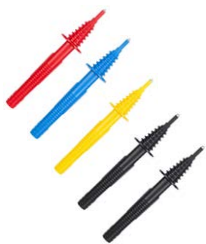
Pin probe (banana socket) red / blue / yellow / black B1 / black B3 WASONREOGB1 WASONBUOGB1 WASONYEOGB1 WASONBLOGB1 WASONBLOGB3