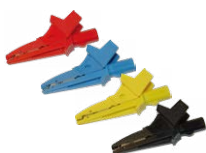
Crocodile clip red / blue / yellow / black WAKRORE20K02 WAKROBU20K02 WAKROYE20K02 WAKROBL20K01