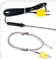
Temperature measurement probe (K-type, bayonet) WASONTEMP probe (K-type, metal) WASONTEMK2