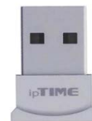
Adapter for data transmission (USB)