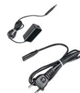
Z-34 power supply