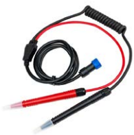
Set of cables for measuring internal impedance