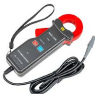
C-130BE measuring clamp