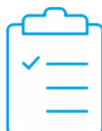
Declaration of verification