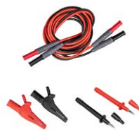
Set of cables for voltage measurement