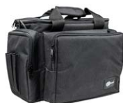
L-17 carrying case