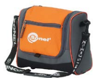
M-6 carrying case