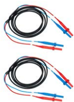
Double-wire test lead 3 m (10 / 25 A) CAT IV 1000 V