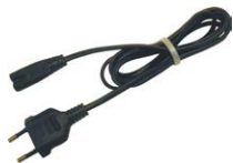
Mains cable 230 V with IEC C7 plug